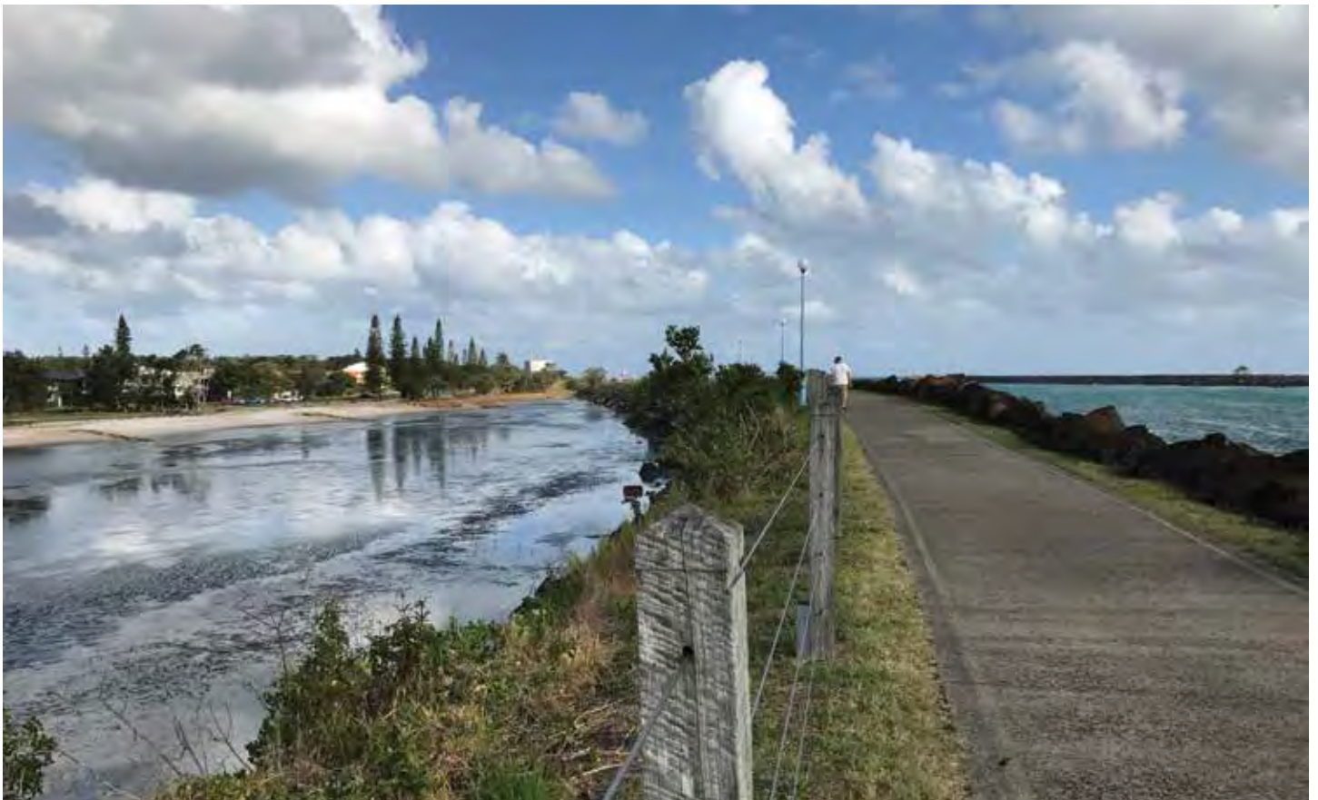
Figure 1: Unique and beautiful natural landscapes in regional Australia support healthy living – this coastal path on the NSW North Coast encourages recreational use by walkers and cyclists of every age.

The Hunter New England Local Health District (LHD) has made a significant contribution to promoting regional health and wellbeing with its 'Liveable Communities Program'. 2 Focusing on 'liveability' in the region's neighbourhoods, towns and cities, there are four principles at the centre of this Program: connectivity; sustainability; accessibility; and flexibility. The legacy of this work is a comprehensive suite of