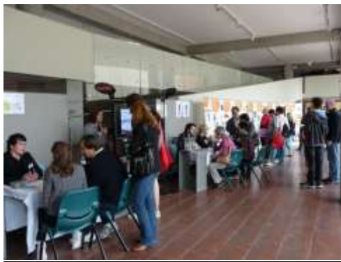
Above: University of NSW Open Day 2010