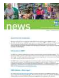
The HBEP Newsletter

The Healthy Built Environments Program Newsletter was launched in September 2010. The newsletter is distributed to a wide range of healthy built environment stakeholders.