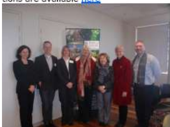
Above: Article on PLA Seminar

On the coldest June morning for many years, over 50 people from a wide range of organisations braved the weather to join us for breakfast at Rouse Hill Town Centre. With the support of Hills Shire Council and CLOUSTON Associates we brought together presenters from PCAL, NSW Department of Planning, Planning Institute of Australia and the Healthy Built Environment Program. Copies of the presentations are available here .