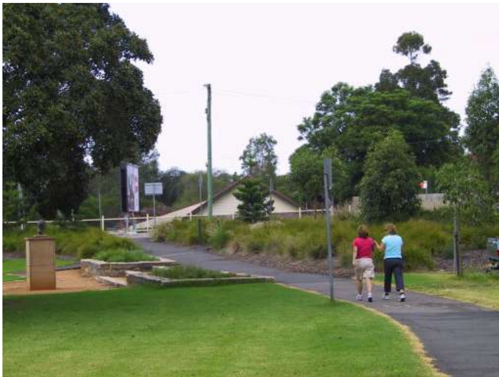
Above: The Importance of Infrastructure for Walking

Further information about projects listed in this Annual Report can be found on the Healthy Built Environments Program website: http://www.fbe.unsw.edu.au/cf/hbep/