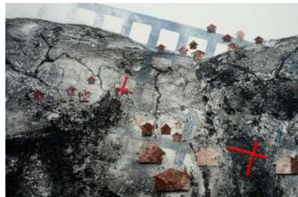
Above: Contested Landscapes Exhibition Catalogue Cover