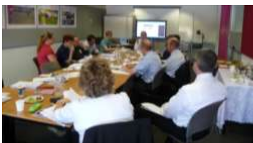
Above: Inaugural Advisory Board meeting on 22 March