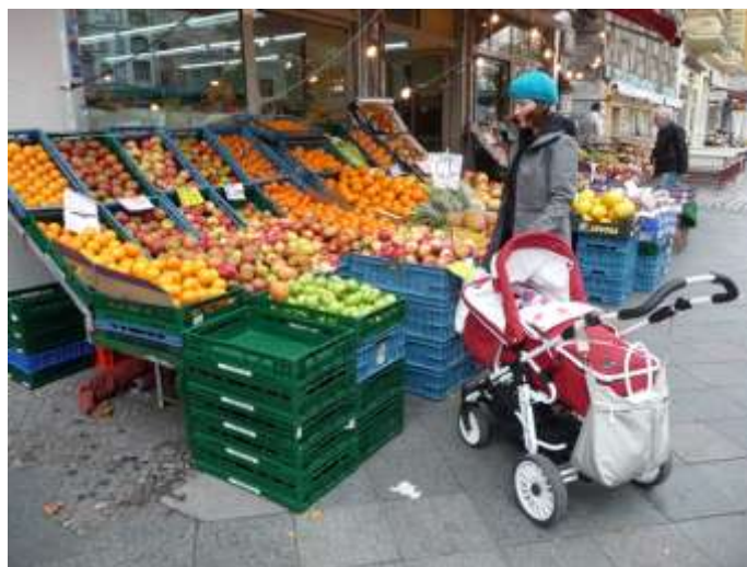
Above: Access to Healthy Food is Essential for a Healthy Built Environment