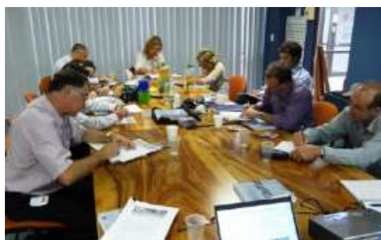
Above: Workshop at Coffs Harbour

Of the 43 Area Health Services staff who took part in these capacity building workshops: