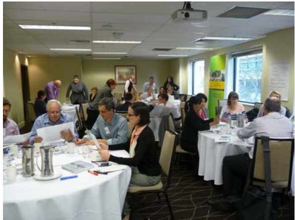
Images from the NSW Health Professionals' Capacity Building Workshops.