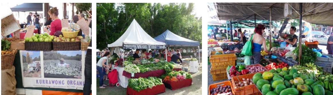
Farmers' markets with similar features to those surveyed.