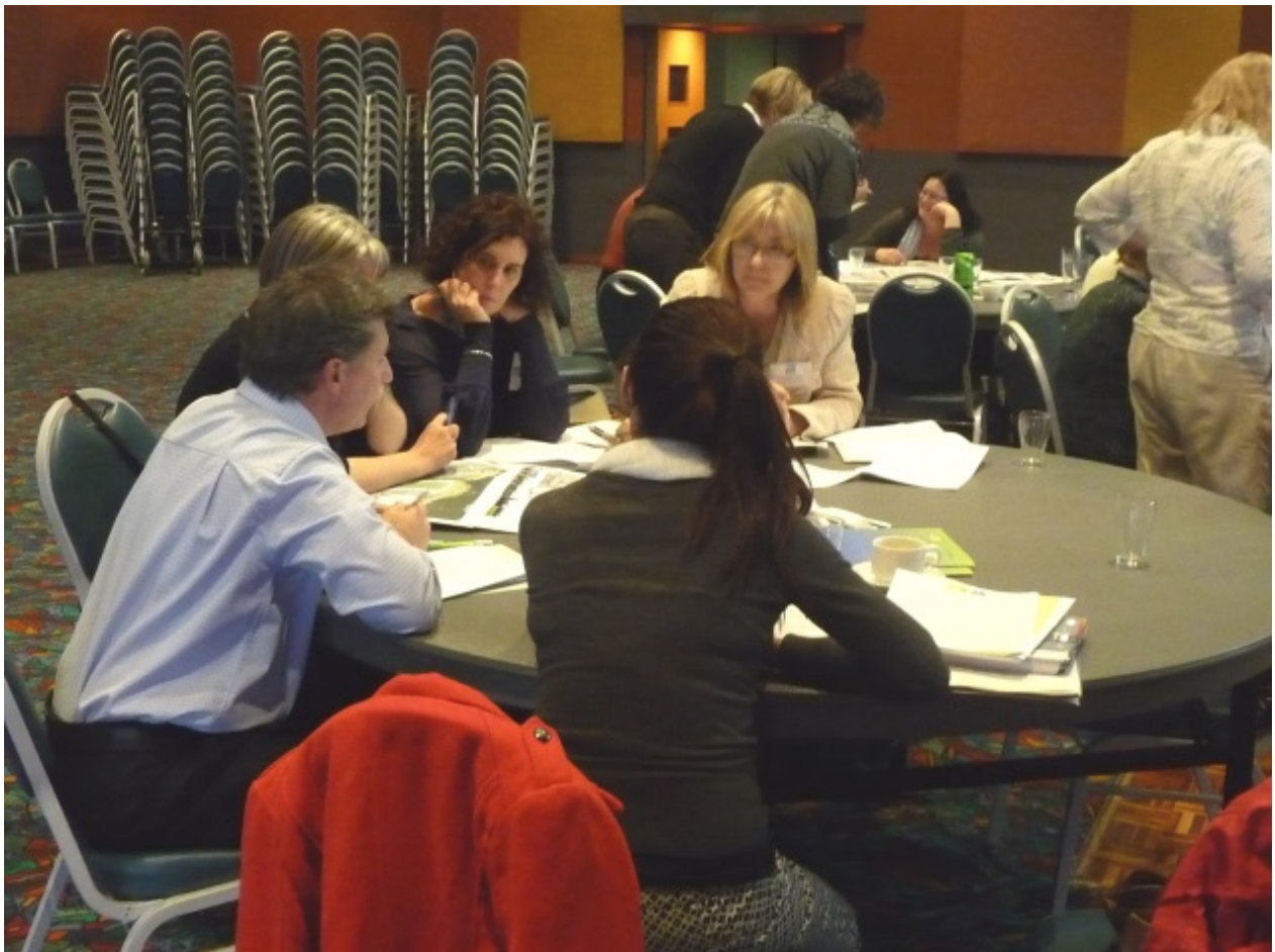
A regional capacity building workshop for professionals keen to learn about the planning system.

HBEP employees were involved in different meetings related to strategic and governance matters both within UNSW and beyond. Key meetings for 2013 involved relationship building with healthy built environment stakeholders, as well as progressing HBEP strategic initiatives. HBEP staff also attended their own retreat in April, monthly City Futures Research Centre Team Meetings and a City Futures Research Centre annual retreat in October.