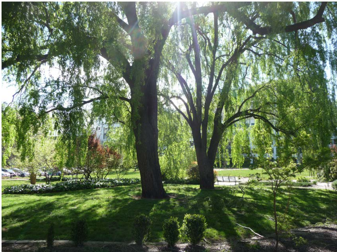
Green open space in urban areas has a positive impact on the UHI by reducing temperatures.

Read more about the CRC and the many research activities underway at: http://www.lowcarbonlivingcrc.com.au/ .