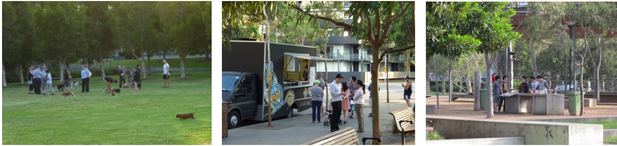
L to R: Victoria Park: Residents and their dogs gathering in a park, early evening; people buying dinner from a food truck; a group of people having a barbeque on a Saturday.

A report template was developed to structure the results of the audits. The template provides for the presentation and analysis of the images, mapping and qualitative data collected. Preparation of these reports will be completed in 2014. A Healthy Neighbourhood Audit of the Renwick development will be undertaken in 2014.