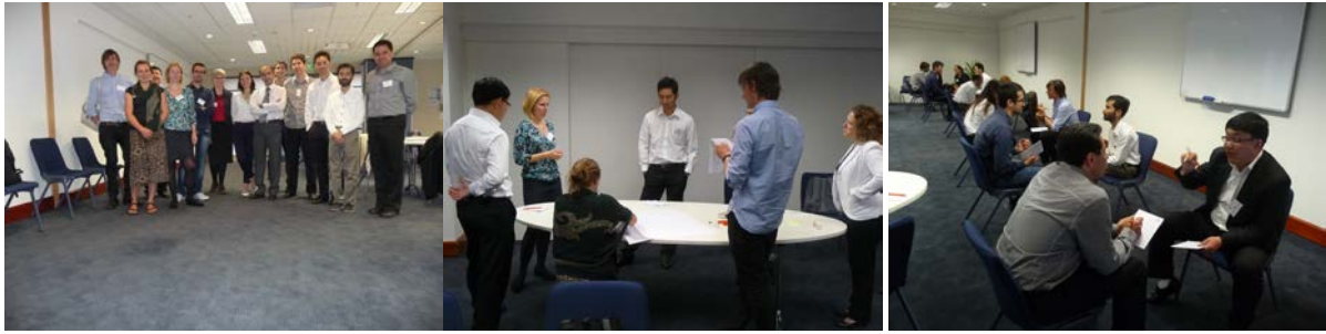
The PhD students exchanging with each other at their workshop.

The approved CRC project 'Urban Micro Climates: Comparative study of major contributors to the urban heat island (UHI) effect in three Australian cities (Sydney, Melbourne, Adelaide)' has also been signed off by the Faculty of the Built Environment. The co-relations between urban morphology, surfaces, vegetation and the urban energy balance are being explored. The methodology is based on end-user needs and potential impact on the use of public spaces in cities, including direct and indirect health impacts. The research outcomes will provide evidence for urban policy, planning and data on the UHI effect of materials for construction manufacturers and managers, transferable to other Australian cities.