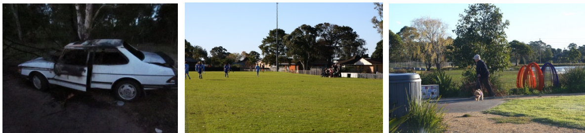
L to R: Airds Bradbury: A burned out car in an unlit area in at night; a group of people watching a soccer game on a sports field on a Saturday; a woman walking her dog on a Saturday.