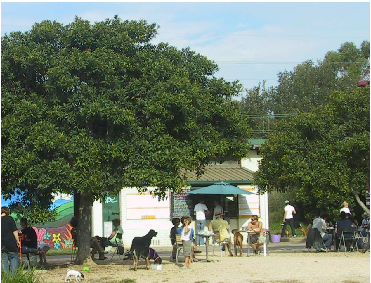
Café Bones, Leichhardt Dog Park.