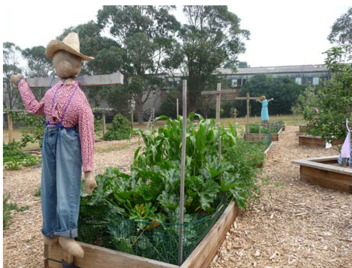
A school kitchen garden typical of many such healthy built environment initiatives found across Australia.

The theme of the symposium will be 'Healthy Built Environments: Making it Happen'. This implies a focus on how practitioners and researchers can enact real change to create environments that are more supportive of human health. A relatively broad conceptualisation of 'change' will be assumed, and it is intended to explore strategies for not only infrastructure modifications but also ways to better engage key stakeholders. A tentative date of the 7 April, World Health Day, has been set. The committee is looking at hosting the symposium at UNSW with an afternoon fieldtrip to one of the field study sites in the HBEP ARC Linkage Project Planning and Building Healthy Communities .